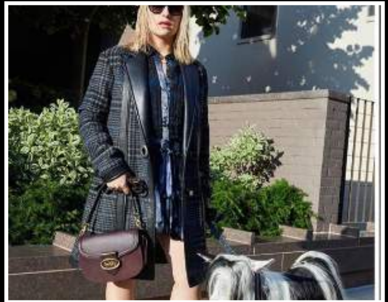
Coach F/W 2019 - Adv campaign.