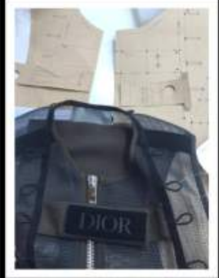
Dior men's autumn/winter 2020