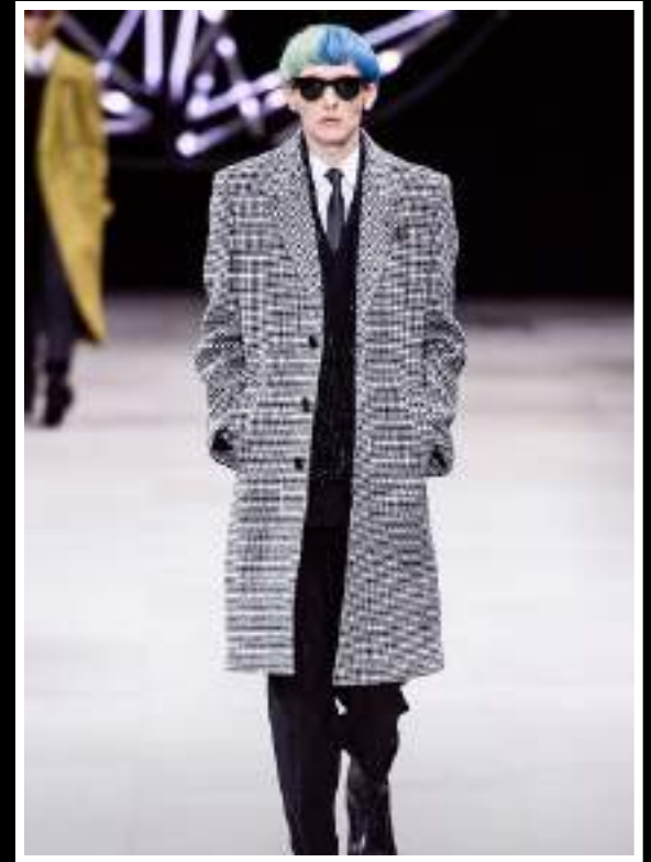
Celine Fall 2019