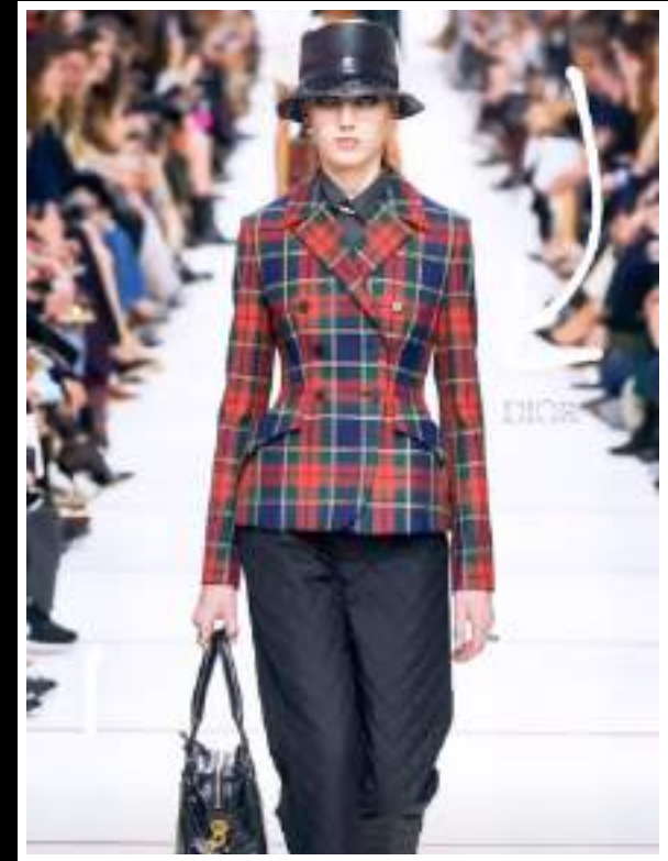
Dior F/W 19-20

In addition to creating patterns, I also take care of CAD Marker Making and quality control. Part of my job includes also matching every single line of the fabric with its respective piece of the model in order to obtain a clean and luxury result as you can see above.