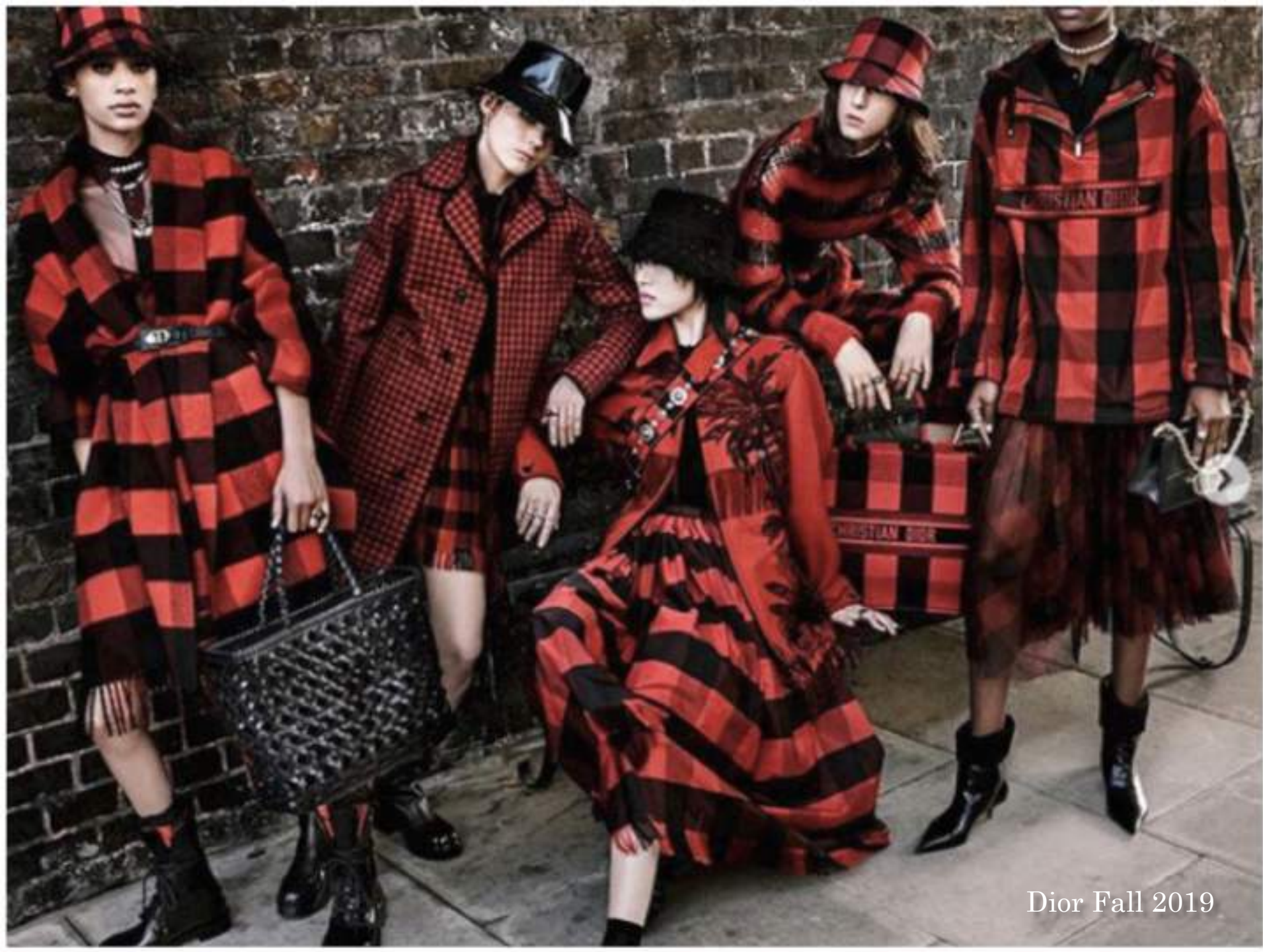
Dior Fall 2019