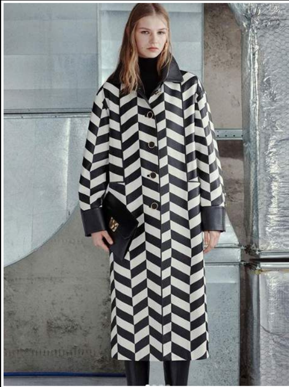
Bally Fall 2020 - Leather coat.